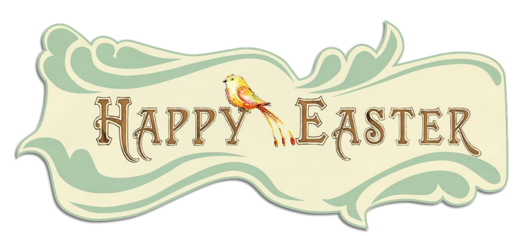
April 4 – Easter Sunday April 22 - Earth Day

Featuring this Month: Two Yolks' Café 949 Robbins Rd Phone #(616) 935-7538 Open for Breakfast and Lunch daily