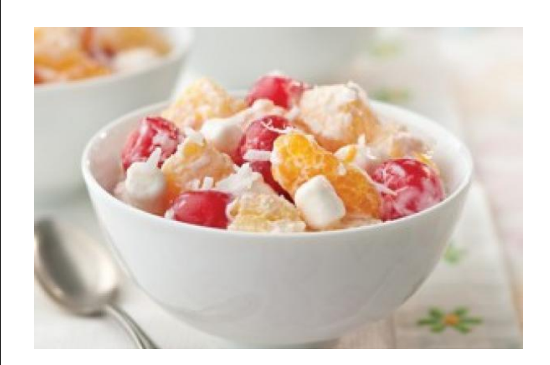
Ambrosia Salad – It's an Easter/Spring favorite:

1 can Mandarin Oranges 1 can Pineapple 3/4 cup green grapes 1 jar maraschino cherries 3/4 shredded coconut 1 c. mini marshmallows 1/2 c. sour cream 8 oz. cool whip 1/2 c chopped pecans (optional)